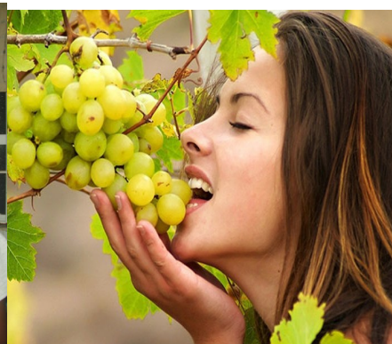
Finally it becomes Sweet

Second, it became bitter. Once again her spiritual guide accompanied her with encouragement and prayers. She withstood all these difficulties and sufferings. Her prayer life and trust increased. Finally she reached a stage when she experienced the sweetness of God's love and care. Now she invited her friends and says: "Taste and see how sweet is the Lord. I will never give Him up!"