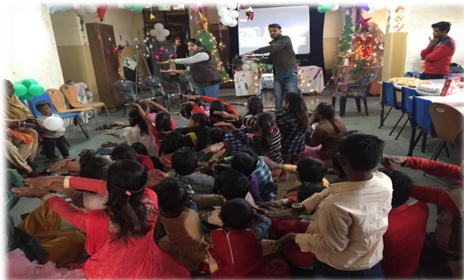
YAR Children from the Neighbourhood

His Love was all inclusive it is the same spirit with which DB ARK reaches out to its neighbours. The Socio-Economics barrier of Caste, Ethnicity, Wealth, and other Discriminating barriers are challenged and efforts are made to bring in Love, Unity and Harmony.