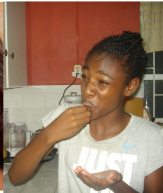
Next it turns bitter