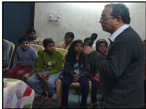
PY Children from the Neighbourhood

While the children are simple, open and transparent and open to relating to other children of different backgrounds, The adults finding difficult to allow their children to Mix with other children whom they consider lower than them on various socio-economic factors.